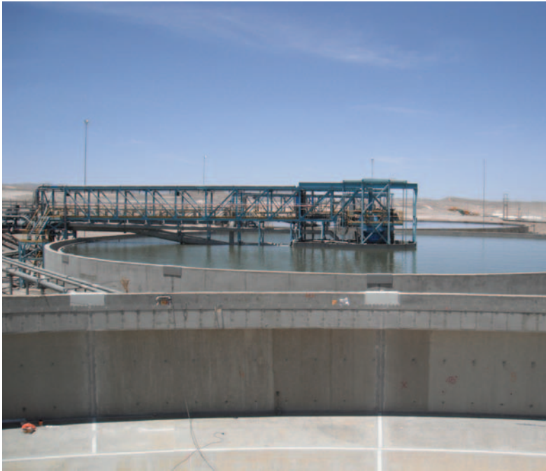
FLSmidth 60 m high density thickeners at Esperanza, Chile (Photo courtesy of FLSmidth).

K nicht Piésold and Co. hosted its annual roundtable discussion on March 17, 2011 at the Stockman Hotel and Casino in Elko, NV. The theme for Roundtable 2011 was, “High density tailings, paste, and filtered tailings,” although the topic may well have been subtitled, “Don’t prematurely rule out any technologies before they are given their day in court.”