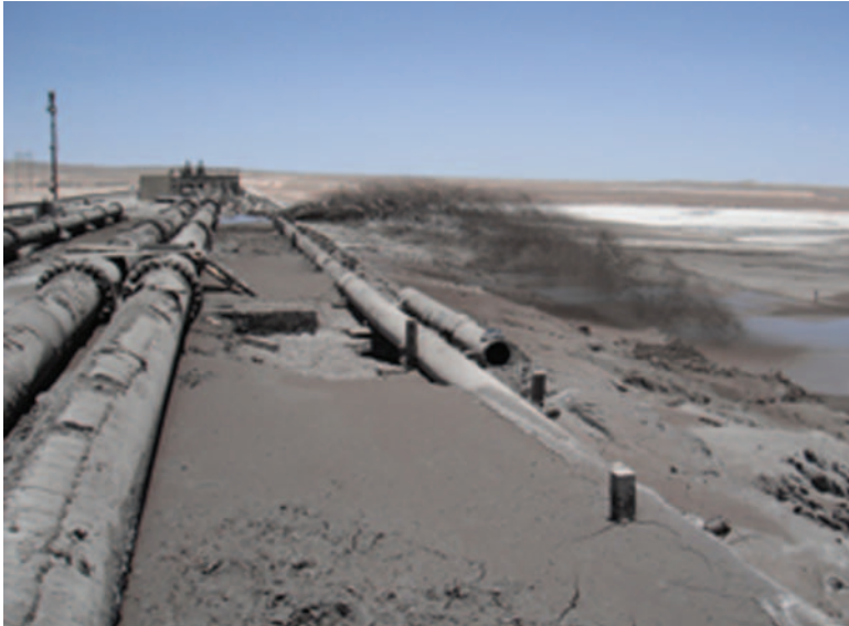
Tailings disposal at Esperanza, Chile (Photo courtesy of FLSmidth).

com/perumin_cms/upload/archivos/TT-184%20Final.pdf. The Yanacocha Mine's La Quinoa Mill has a thickened tailings storage facility that is contained within an active heap leach facility. It is a unique and unprecedented design that provides its operator with cost, land-use and closure efficiencies. This design requires that leach ore embankments retaining the tailings provide the same level of stability required of major tailings dams. As compared to conventional tailings dam construction, the leach ore in these embankments is consistent with normal heap leaching operations; that is, with thick uncompacted lifts to maintain adequate permeability for leaching. The resulting loose structure makes the proper assessment of static and dynamic liquefaction a critical issue. The key design principle for avoiding liquefaction is to maintain the phreatic surface well away from the outer faces of the embankments and within large unsaturated structural shells. The geotechnical design work that led up to this design was quite impressive. The facility was successfully commissioned in early 2008 and its performance to date has met or exceeded its design objectives.