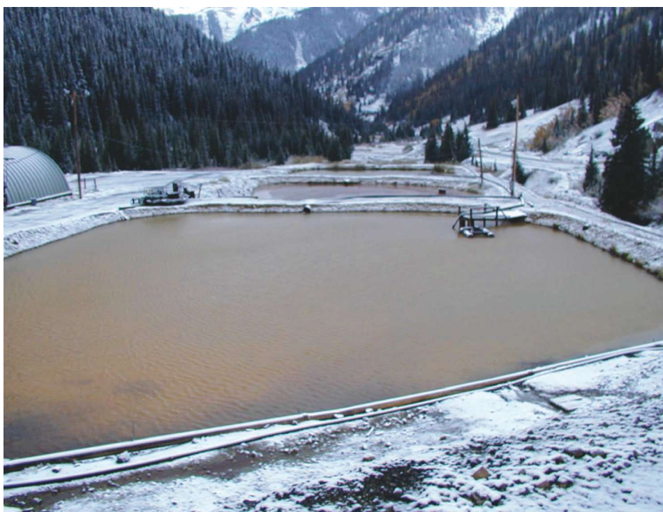
SGC constructed a water treatment facility for Cement Creek at Gladstone.

With the arrival of mining in the Upper Animas 140 years ago, drainage from mine adits, discharges of tailings to water ways, and the weathering of waste rock added to the naturally high metal and acid loads in the Animas River and its tributaries. These discharges continued long after the mines were no longer active. The total quantity of tailings generated from 1873 until 1964 is enormous. "The total amount of tailings created in the watershed in 125 years of