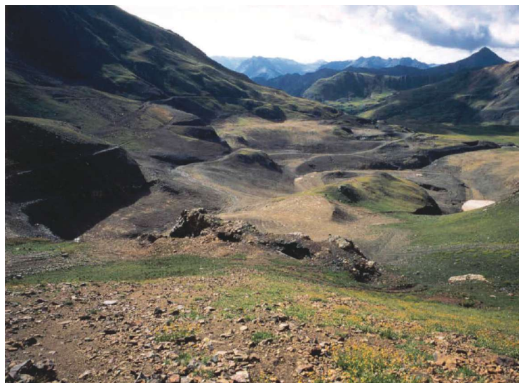
Before and after: The Sunnyside Basin as it appeared in 1988 (left) shortly after SGC took over operations and how it appeared in 1996 after SGC's reclamation activities.

reclamation projects in the region. Many of these reclamation projects were on ground never owned or operated by SGC. This agreement was memorialized in a Colorado District Court-approved Consent Decree, endorsed by the EPA, and approved by the BLM, with all regulators noting the benefit of the watershed approach to the environment.