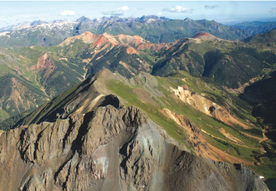
San Juan Caldera—The area includes the drainage basins of three main tributaries: Mineral Creek, Cement Creek and the Animas River. Elevations range from 9,305 feet in Silverton, Colorado, to more than 13,800 feet in the surrounding mountains.

Metals loading adversely impacts the Animas River in the area around Silverton, San Juan County, Colorado. The metals of concern include iron, aluminum, cadmium, copper, lead, zinc, arsenic and nickel. The metals loading in the Animas River is due to acid rock drainage that is created when sulphide minerals are exposed to air and water to produce sulphuric acid. The acidic water can dissolve area minerals and then deposit metals in rivers like the Animas. Metals loading in the Animas River has limited aquatic life, including the trout fishery downstream from Silverton.