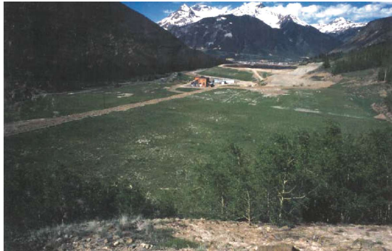
Before and After: Mayflower Impoundments Nos. 3 and 4 as seen in 1992 (left). SGC regraded the top of No. 3 (foreground), capped it with subsoil and reseeded it. SGC relocated 80,000 tons of waste to No. 4, regraded the area, and re-seeded it. This is how it appeared in 1995 (right).

mining is on the order of 16 million to 18 million tons if one extrapolates from the figures from 1873 to 1964. Of this, about 12 million tons is reasonably accounted for, mostly in the Mayflower Mill impounds [where impounding began in 1935]. The majority of the remaining 4 million to 6 million tons were likely directly discharged to surface drainages.