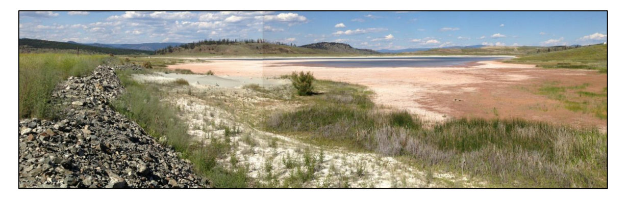
Figure 3. TSF pond on July 9, 2013; looking northeast