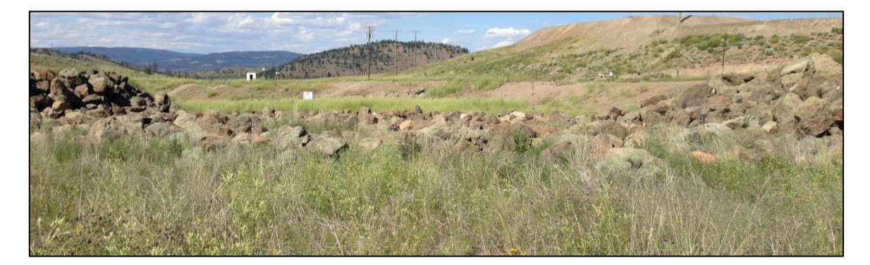
Figure 2. Riprap lined spillway entrance with reclaimed tailings beach in the foreground and waste rock dump on the right side of the frame; looking downstream (northeast)

The climate in the project area is typical of the dry BC Interior Region, with generally low total precipitation and high evaporation, and correspondingly low streamflow rates. Located in the rain shadow of the Coast Mountains, this area has a semi-arid steppe climate characterized by generally cool, dry winters and hot, dry summers, with low humidity. Temperature and precipitation records for the mine area indicate mean annual temperature and precipitation values of 7.3°C and 305 mm, respectively, while the annual potential evapotranspiration (PET) was estimated using the Thornthwaite equation at approximately 565 mm.