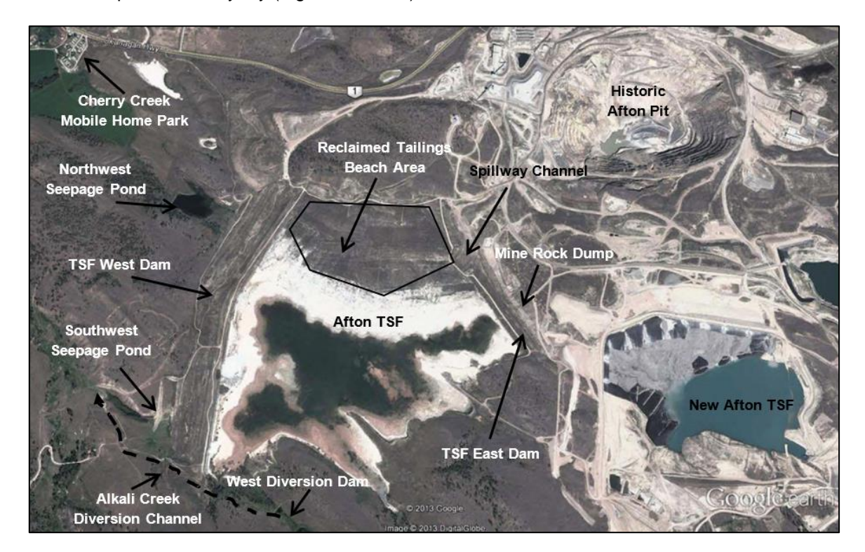
Figure 1. General arrangement of the Afton TSF

ultimate design width. Consequently, the East and West Dams were overbuilt for conditions when operations ceased, and the crests of the dams were left at approximately 100 m wide. A portion of the East Dam was buttressed by a waste rock dump that is higher than the East Dam itself, while the West Dam was constructed with relatively shallow downstream slopes (shallower than 2H:1V). The spillway is designed to pass the PMF and has an invert constructed 2 m below the crest of the East Dam. The spillway consists of a 50 m wide riprap lined channel (Figure 2) that transitions to an unlined earth channel, which curves along the toe of the East Dam and leads to a haul road located along the perimeter of the Historic Afton Open Pit. The sand tailings beaches have been capped and revegetated, and the TSF pond is mostly dry (Figures 1 and 3).