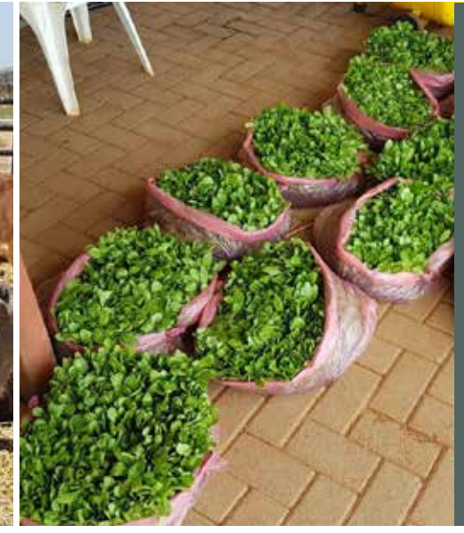
Developed structures and livestock of the Zwaartkoppies farm, as well as crops cultivated by three different co-operatives working at the farm