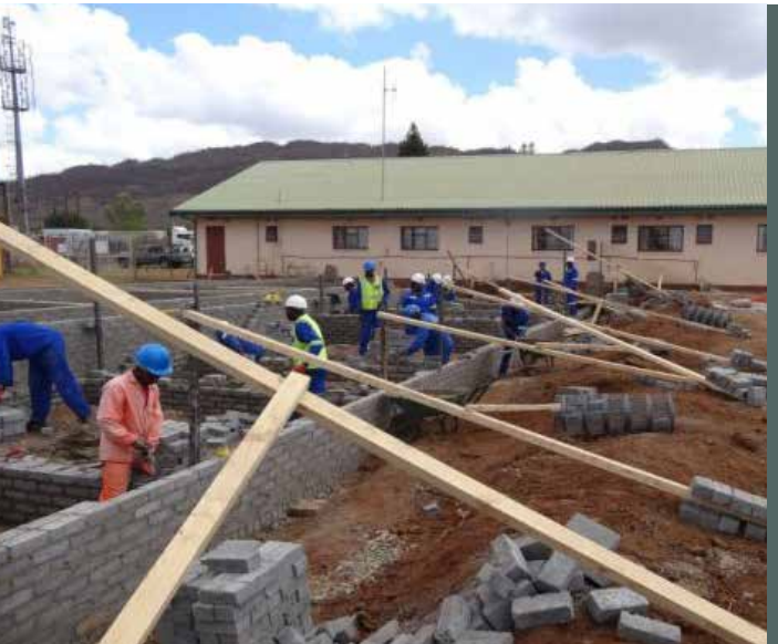
Renovations of the youth centre. The centre is primarily utilised for youth skill development focusing on health awareness and life skills