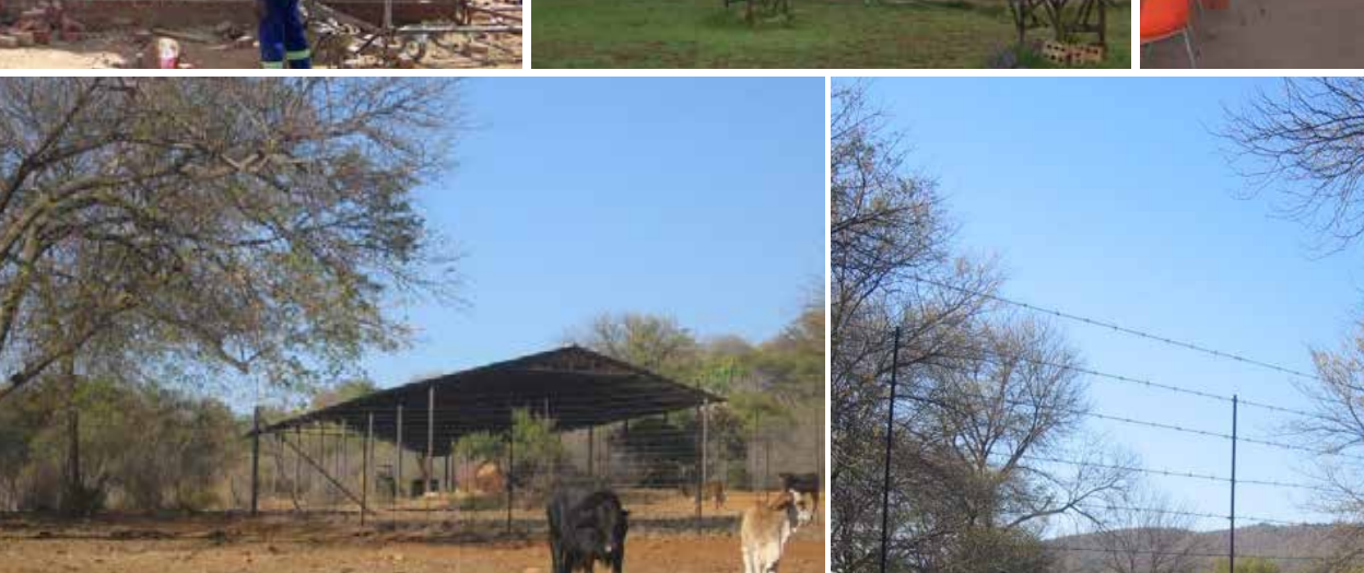
Zwaartkoppies farm acquired by Bakubung Platinum Mine with a purpose to nurture community based farmers