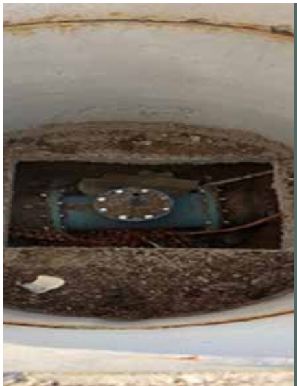
Construction of the bulk water infrastructure that will attempt to provide long term water solutions to water shortages in Ledig